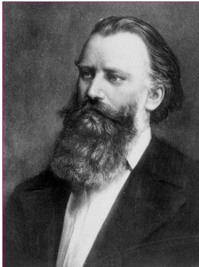
B r a h m s — c.1890

The final piece deepens an introspective impression while introducing a more flowing, continuous narrative. The interplay of voices is especially subtle, with inner lines