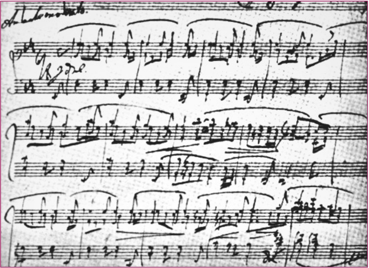
Intermezzo N° 1 in E flat major

Through these facsimiles, performers and scholars can follow the evolution of musical ideas from first conception to final form. Subtle details such as phrasing slurs, dynamic inflections, and even the physical spacing of notation suggest interpretative possibilities often unrevealed or standardised in printed editions. These manuscripts feel less like relics and more like living documents, bridging the distance between composer and performer, and bringing us closer to the human act of composition itself.